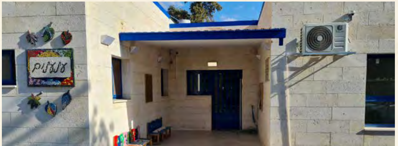
Alalim Rehabilitation Day Care Center, Kibbutz Hafetz Haim