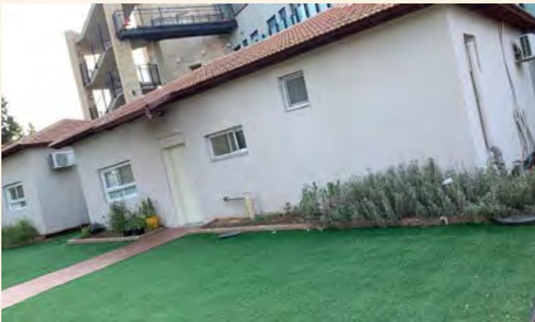
Ali Program, Givat Washington